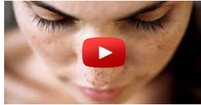
How To Remove Dark Spots