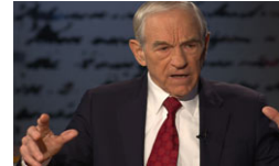
Dr. Ron Paul: "Crisis Bigger Than 2008 Is Coming"