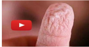
ODD Trick Stops Erectile Dysfunction